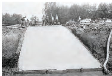
The new Cruiser Slip 1972

Sailing cruiser owners immediately saw that it would be possible to have a cruiser slipway leading into the new cut. Club funds were allocated and while the cut was being dug a new concrete slipway was laid by the members. The quality of the work done in 1972 is evidenced by the fact that the slipway is still in use today with very little maintenance.