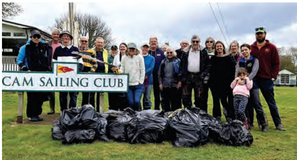
Cam Clean-Up March 2025

At the beginning of March, before the birds had started building their nests in the reeds, club members got together for the club's annual Cam Clean-Up. Working from boats and walking along the riverbank, rubbish was collected on the stretch of the Cam from the club grounds at Clayhithe down river to Bottisham Lock. Afterwards, the volunteers were rewarded with a delicious BBQ lunch in appreciation of their efforts.